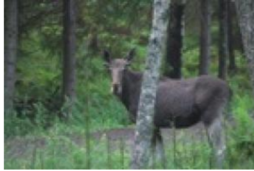
Moose (Alces alces), (Metla/Erkki Oksanen)

Several carnivores can be found in Finland's forest: the brown bear, the wolf, lynx and wolverine. According to the latest evaluations there are about 1000 brown bears and at least 150 wolves in Finland. Game and reindeer management in Finland is practiced within the limits permitted by the sustainable use of natural resources. The most common game animals are elk, hare, grouse and waterfowl. The authorities and local game management associations in Finland safeguard the conditions for game in Finland by directing the diversified use and management of the natural resources on which they are based.