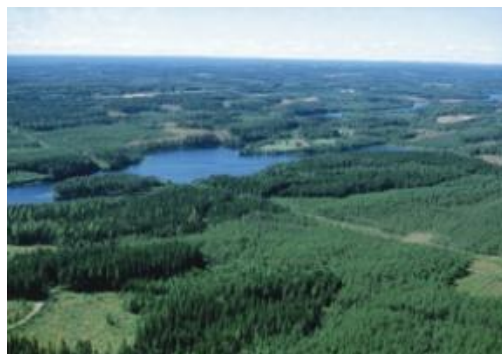
Finnish forest and water landscape