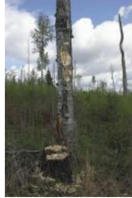
Deadwood is left in the forests in woodcuttings. Deadwood helps the survival of certain species (e.g. woodpeckers) on the site across tree generations.