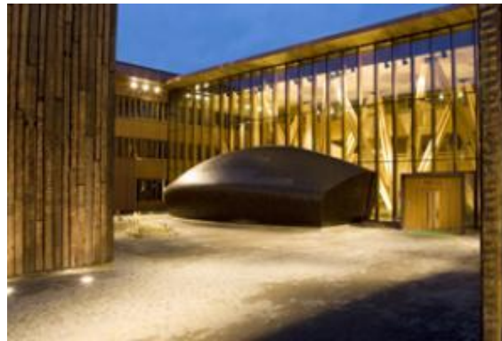
Wooden construction. Metla House in Joensuu, Finland.

The industrial use of forests for sawn timber and paper products began in the late 19th century. Nowadays forestry and forest industries account for approximately 6 % of the Gross National Product. Relative to its size, Finland is more dependent on forests and the forest industry than any other country in the world. As a consequence, Finland has accumulated an expertise in forestry and industrial manufacturing of forest products that is unique in Europe.