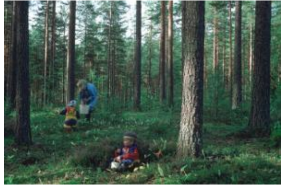
Collecting mushrooms and berries for private consumption is common in Finland