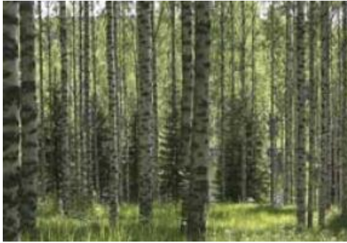
Finnish birch forest