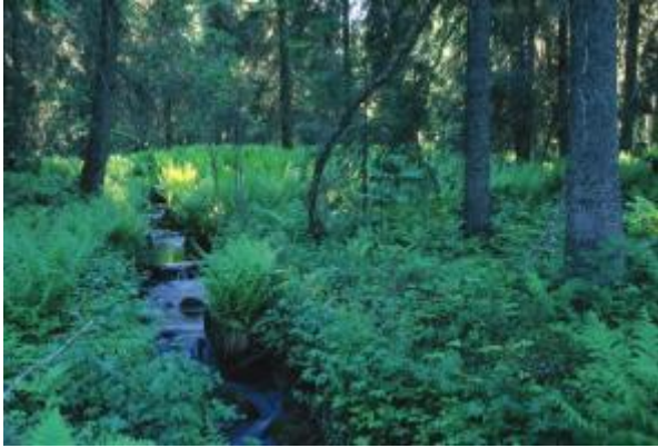
The natural characteristics of habitats of special importance, such as this spring, must be preserved during silvicultural works and woodcuttings.

The Natura 2000 network safeguards the biotopes and habitats of species defined in the Habitats and Birds Directives of the EU 27. The majority of Finland's Natura 2000 areas, 97 percent, are nature conservation areas established under national decisions, or they are part of national conservation programmes or areas protected in some other way. The Natura 2000 network in Finland consists of 1 860 protected sites whose total area is 4.9 million hectares, of which 3.6 million hectares, or three fourths, are land areas.