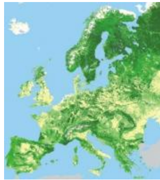
Forest cover in Europe, as percentage of land area (European Forest Institute EFI)

The forest cover in Finland is more extensive than in any other European country. Over 86 % of the land area, some 23 million hectares, is under forests. One hectare is the equivalent of a square, each side having a length of 100 meter. Of the total forestry land in Finland, 71 % is under private ownership (including the Finnish forest industry companies, municipal, parish, shared or have a joint ownership); the Finnish state owns 29 %.