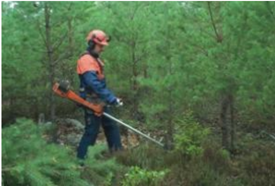
Forest thinning in Finland

In Finland the obligation to regenerate the forest after final wood cuttings has been since the beginning of 1900 and remains to this day the basic principle of the law. The Government encourages forest owners to use good silvicultural practices in the management of their forests. State subsidies are available for safeguarding sustainable wood production, maintenance of forest biodiversity and improvement of the health of forests.